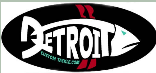
Eric Woodhouse '91 - Co-Owner